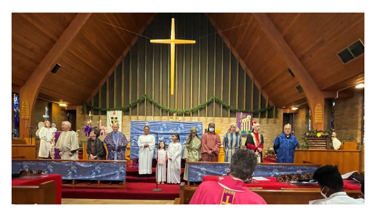
The Annual Christmas Pageant once again told of the birth of Jesus.