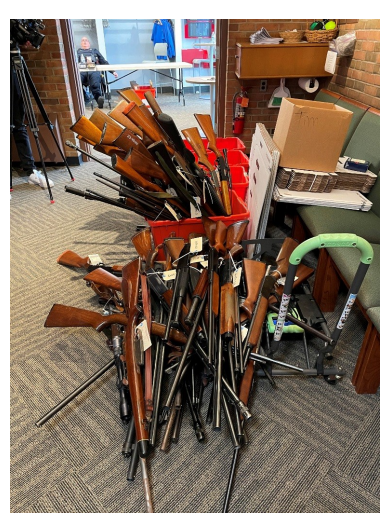
On December 9, we had a very successful gun buy-back event.

Many long guns were turned in along with many hand guns.