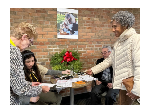
Advent Activities —Making Advent Wreaths and... Buying Christmas Greenery from the Scouts.