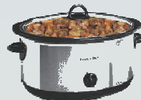
7qt Crock Pot